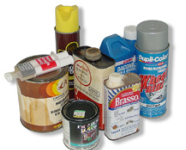
Paints & Chemicals