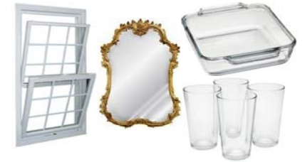
Glass - Windows, Mirrors, Cookware, or anything that is not a jar or bottle.