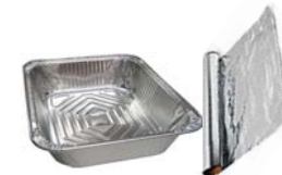
Aluminum Pans & Foil