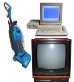
Electronics & Appliances