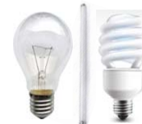
Light Bulbs & Tubes